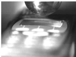
Motorola XTS 5000 radio screen-impact test.

Today's most widely used ruggedness standards include those from four highly respected sources: the International Electrotechnical Commission (IEC), the European Committee for Electrotechnical Standardization (CENELEC) which publishes the European IP (Ingress Protection) standards for electrical equipment, and the United States military.