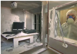
A Motorola MW810 workstation undergoes testing for dust intrusion.

The most widely used IP standards for ruggedized computers and equipment are IP65 and IP54. In each, the IP code shows the level of protection the product provides. When a product is rated IP65, it is completely protected against dust and airborne particles as well as against water jets that simulate the product being washed. An IP54-rated product, on the other hand, is protected against dust in somewhat less harsh environments and against splashing water only. To simulate the most difficult conditions, IP ratings can also go higher. For example, an IP68 rating provides complete dust protection and water protection against total immersion.