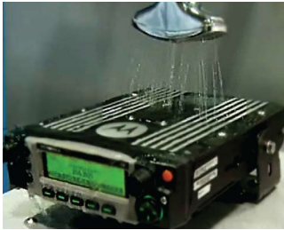
The APX™ 7500 Mobile Radio is rated IP55: protected against dust and low-pressure jets of water.